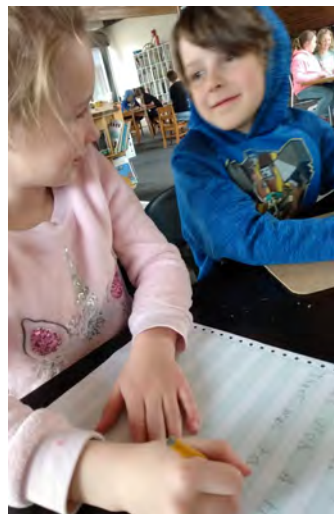
Creative writing session with a buddy.

With all the excitement of summer, it's easy to forget that learning can happen anywhere, anytime. There are libraries, parks, and recreation centers that have amazing programs.