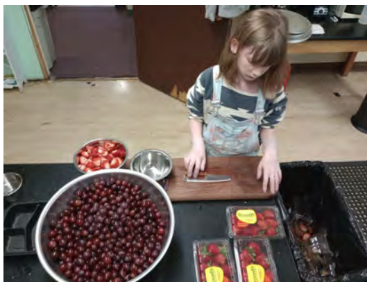
Owl Lola prepares fruit with handmade Walnut cutting boards from Wing micro business.