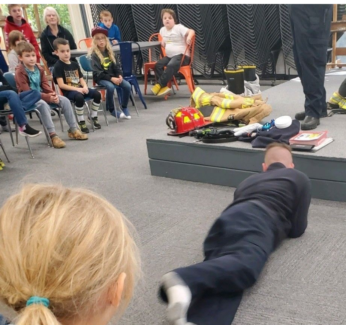
Eagles practice crawling low to avoid smoke inhalation.