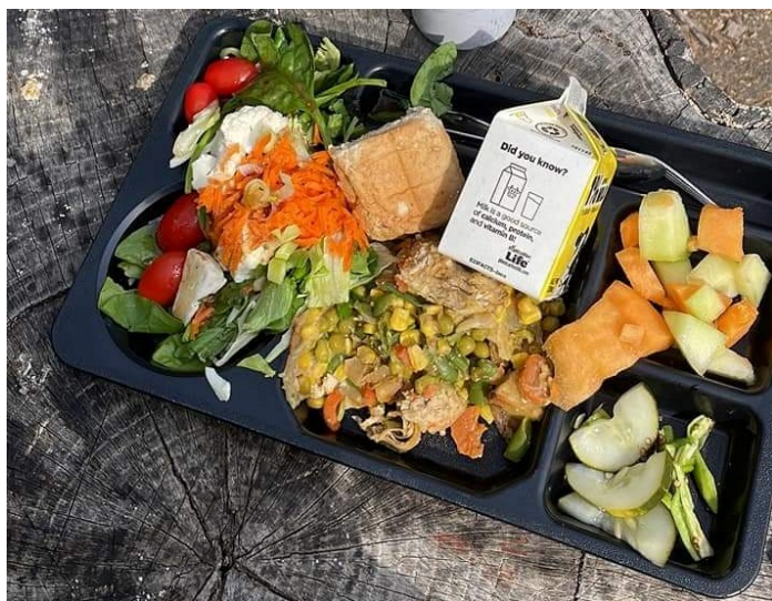
Chicken Pot Pie, Roll, Salad, Melon Bites, Pickled Cucumbers, Milk