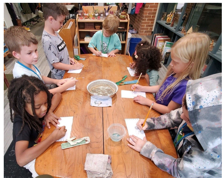
One group of Eagle scientists are engaged in attention to detail, recording of data and analyzing the analogy of pepper dispersing on the surface of water when soap is used during hand washing. Many kinds of germs have been discussed and studied by these students.