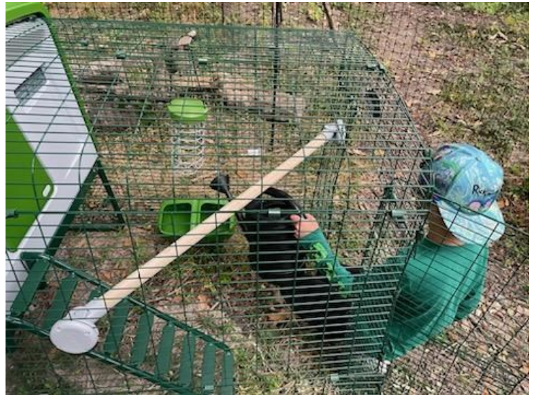
Jude fills the water.