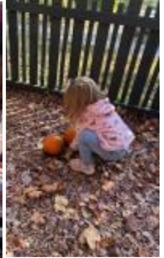
Lucy "finds" a pumpkin.