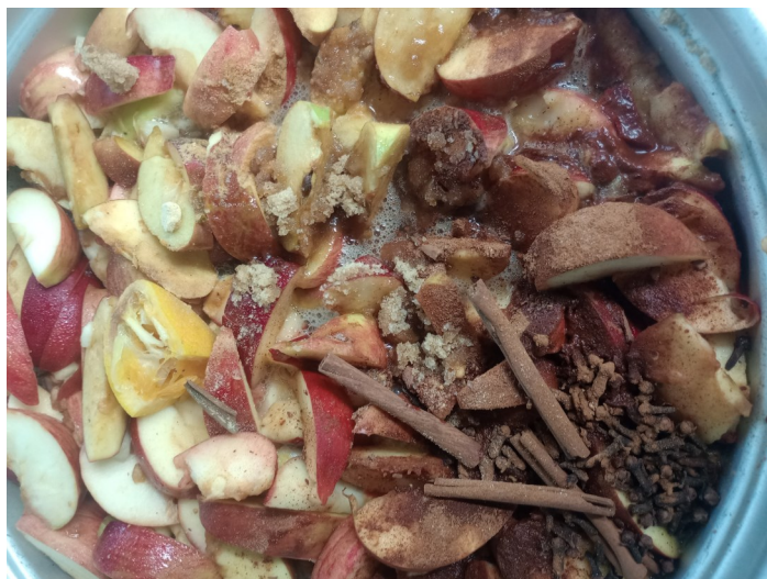
Homemade apple cider