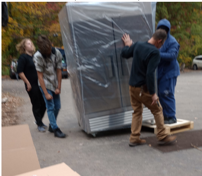
New refrigerator being delivered to help meet food storage needs.