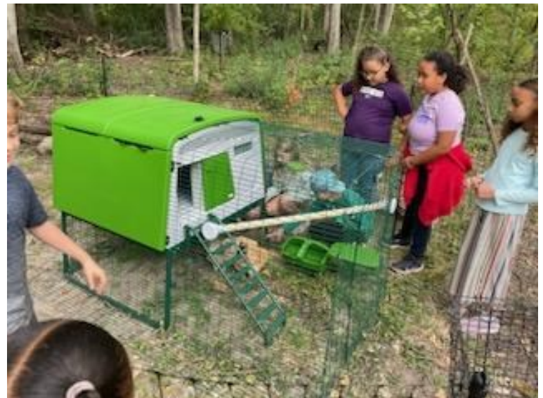
Some work at the chicken coop.