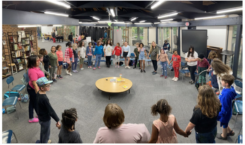
Games are one way Owls build community and team building.