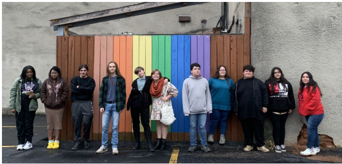
Wing trip to Dayton to see To Kill a Mockingbird

The Nightingale bus arrived in Dayton, Thursday night and a group of Wings attended a Broadway performance at the Schuster Center. Actor Richard Thomas played Atticus Finch in this adaptation of Harper Lee’s Pulitzer Prize-winning masterwork, To Kill a Mockingbird . Set in Alabama in 1934 and adapted by Aaron Sorkin (“The West Wing”), Harper Lee’s enduring story of racial injustice and childhood innocence centers on one of the most venerated characters in American literature, small-town lawyer Atticus Finch. Students who attended were familiar with the cast of characters including Atticus’ daughter Scout, her brother Jem, their housekeeper and caretaker, Calpurnia, their visiting friend Dill, and a mysterious neighbor, the reclusive Arthur “Boo” Radley as the story wrestles with the tragic tale of Tom Robinson. This live theater experience exposed the students to a community of people that have a profound sense of pride in their performance and the work behind it. Our hope is that our students will be inspired in new ways to express themselves through different artistic outlets, including performance art.