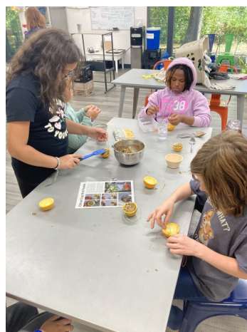
Group makes citrus cup bird feeders.