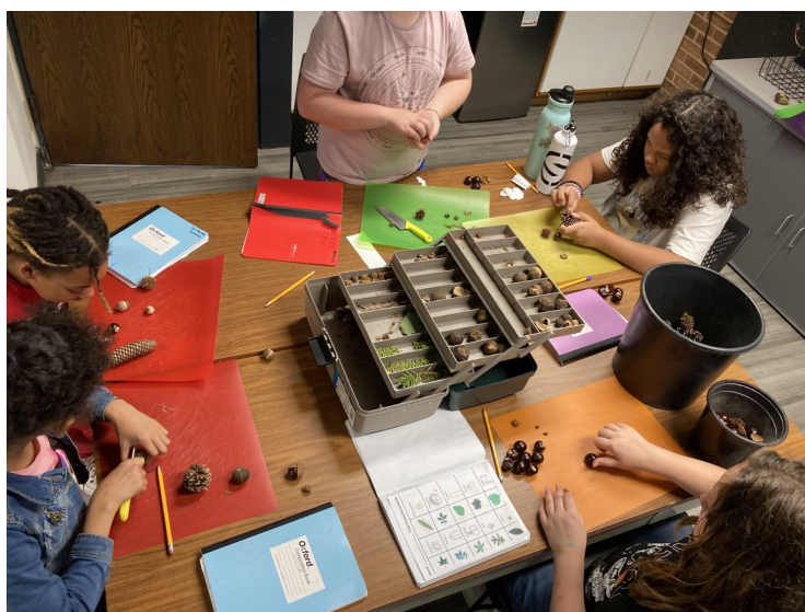
Science Class works on Nut and Seed Dissection.