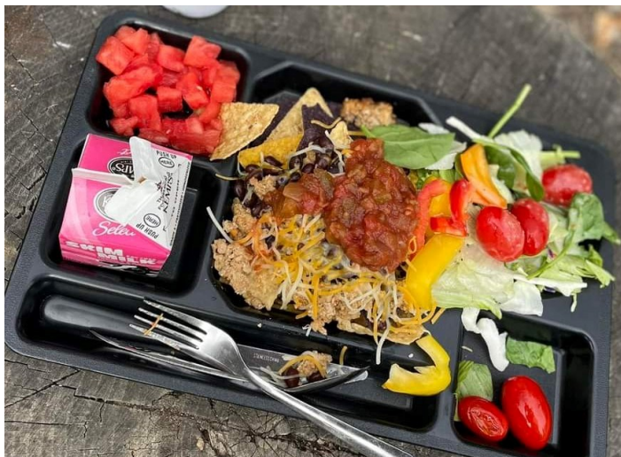
Nachos, Ground Turkey, Black Beans, Cheese and Salsa, Salad, Watermelon Bites, Milk

Students from throughout the school contribute to the fresh, diverse meal program, provided through Gourmet Grub . From practical life skills such as sandwich preparation, to research into the cultural relevance of ingredients, students are met with appropriately challenging lessons. Nightingale's culinary program engages students and asks them to become aware and active in their food choices. Processing local, fresh food teaches healthy eating choices, reducing food waste, and links the student into the nutrient cycle of composting into our school gardens.